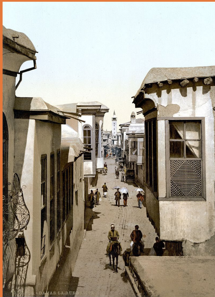
5. DAMASCUS - DAMAS. LA RUE DROITE