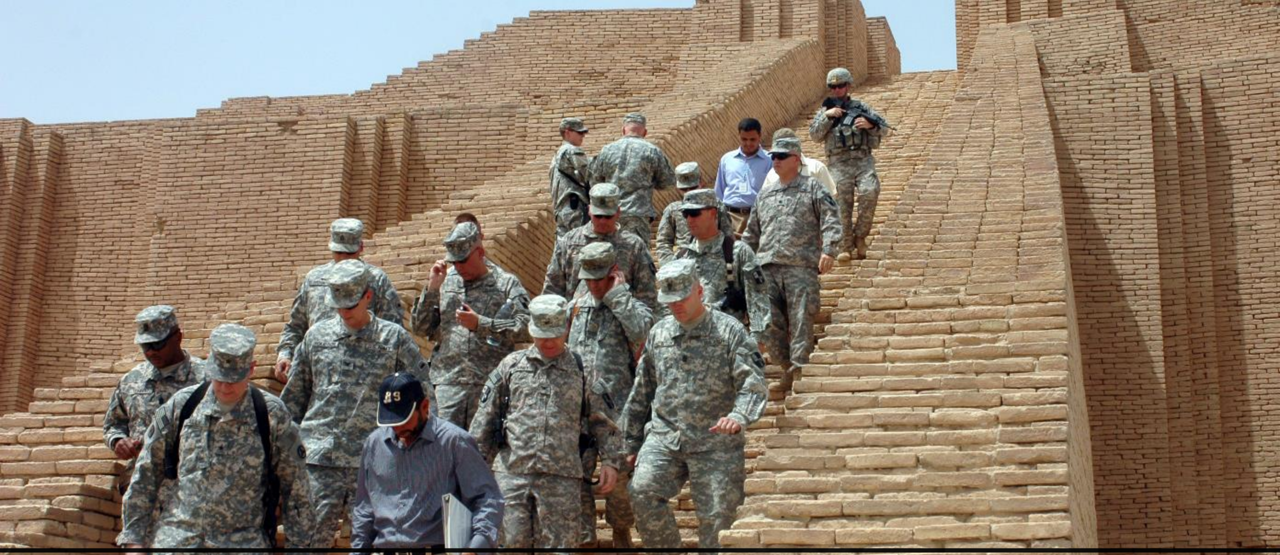
US soldiers descending Ziggurat of Ur (Iraq - 2009)