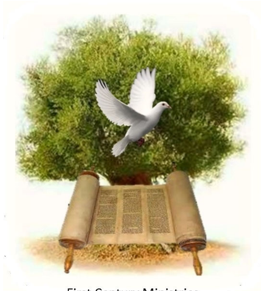
First Century Ministries